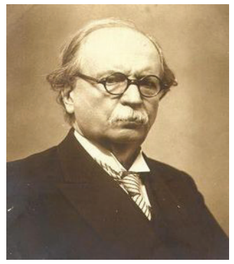
Figure 1. Besim Ömer (1861–1940)<sup>₄</sup>

Aiming to minimize maternal and infant mortality and to train informed midwives, the critical part of Ömer's work was accomplished when a building was ready and equiped (Figure 2). Now it was time to overcome an even more important obstacle. This important stage was to convince the people to give birth in the clinic not at home. Doctors and students were trying to persuade pregnant